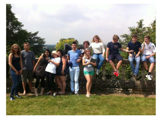
RYLA students chill out after a day of sporting activities in the grounds of Morton Hall overlooking the Warwickshire countryside

The District 1060 Rotary Youth Leadership Awards returned to Morton Morrell following a 10 year break