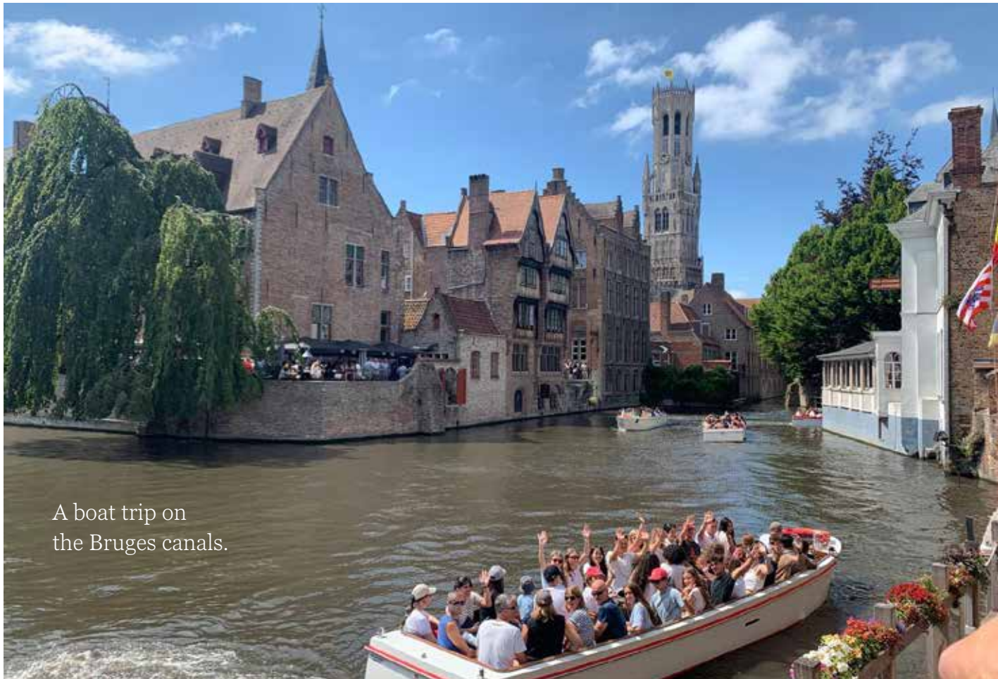
A boat trip on the Bruges canals.