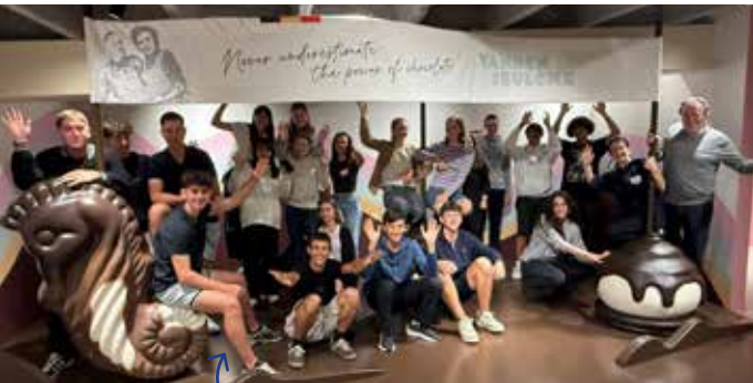
Visit of the chocolate experience.

A town with the flair of a metropolis, where historical heritage goes hand in hand with modern architecture and design.