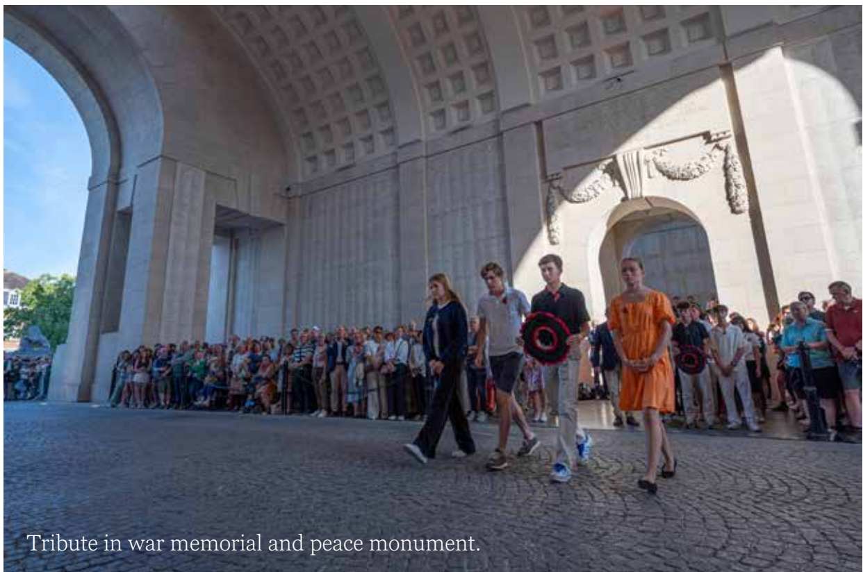
Tribute in war memorial and peace monument.